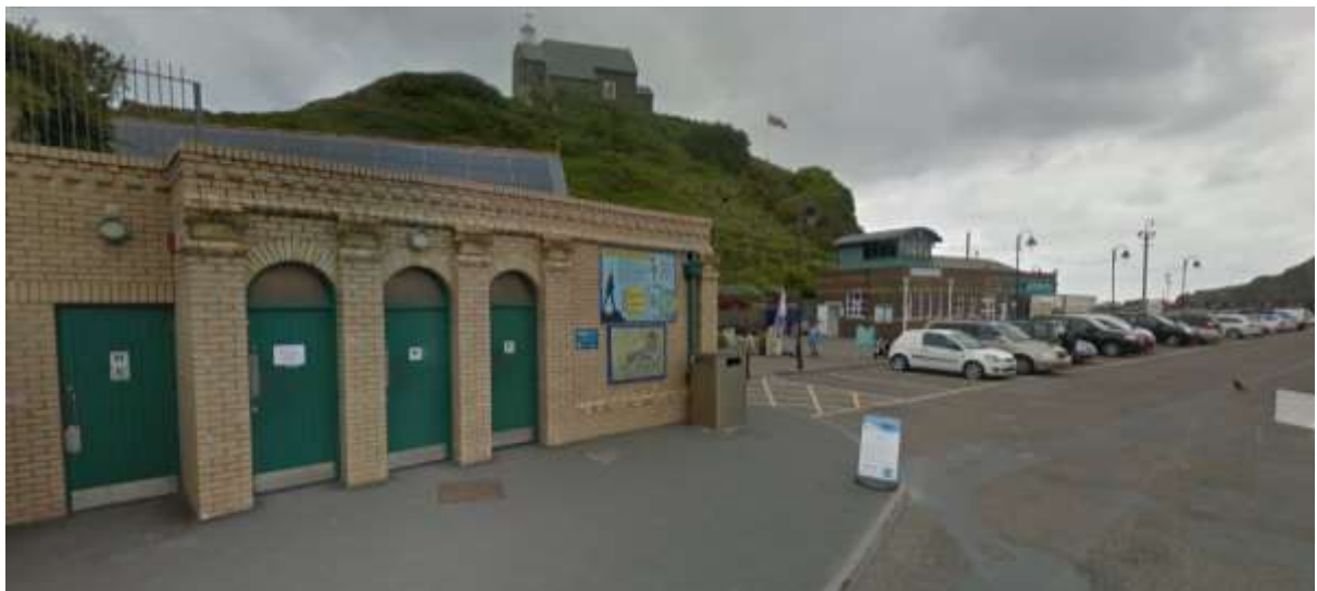
Photo of toilet block (accessible toilet is the first door on the left)

Further details about the toilet can be found using this link .