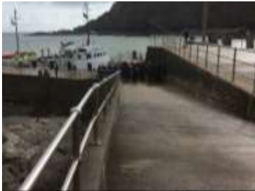
Landing Point 1