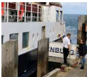
Boarding to Forward Deck

As this is too narrow for a wheelchair, any wheelchair user will need to transfer out of their wheelchair to walk across the gangway and be able to step up and down from it (18cm).