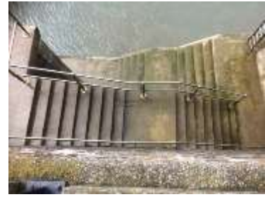
Landing Point 3

If you would like to know which Landing Point your sailing will be using this is possible by enquiring at the Shore Office who will consult the Captain before providing the answer.