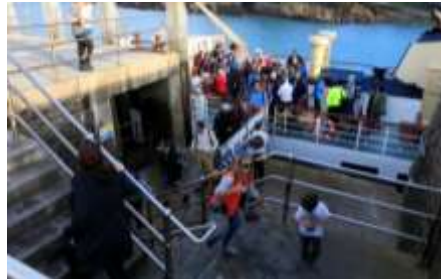
Landing Point 2