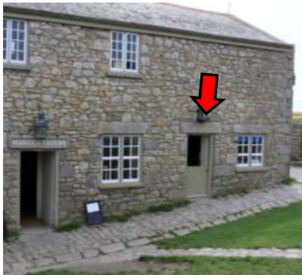
Entrances to Marisco Tavern & Reception

Please be patient, departing visitors may have only recently left and the housekeepers need time to prepare the property for you.