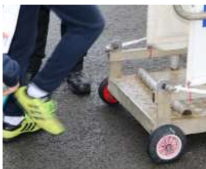
Step onto gangway