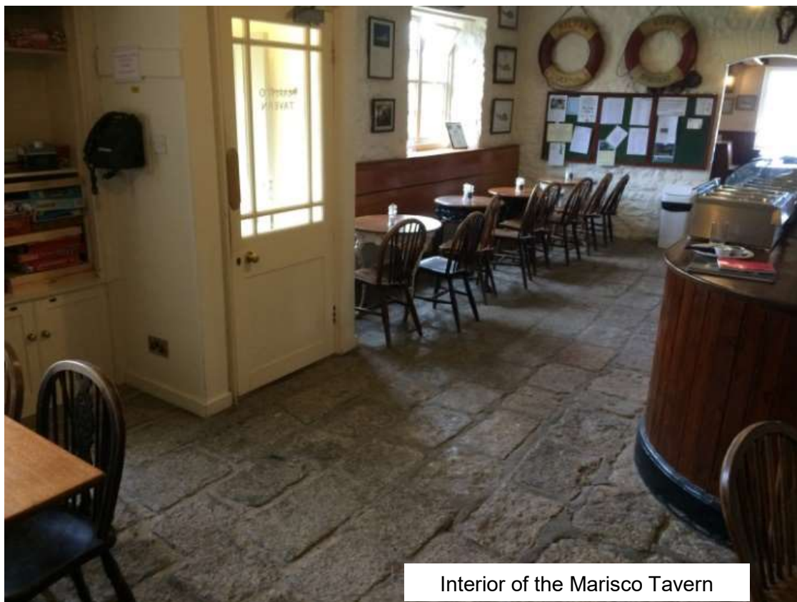
Interior of the Marisco Tavern

Marisco Tavern - The Tavern serves a selection of dishes for breakfast, lunch and dinner. Vegetarian meals are always available and other dietary needs can be catered for, please speak to the chef. Times for meals are displayed on a notice board and the Tavern is open throughout the day for homemade cakes and hot and cold drinks.